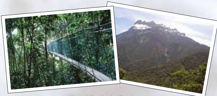
Kota Kinabalu Packages (Duration: 3D/2N or 4D/3N)