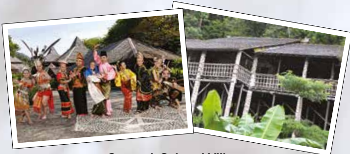
Sarawak Cultural Village (Duration: 4 hours)