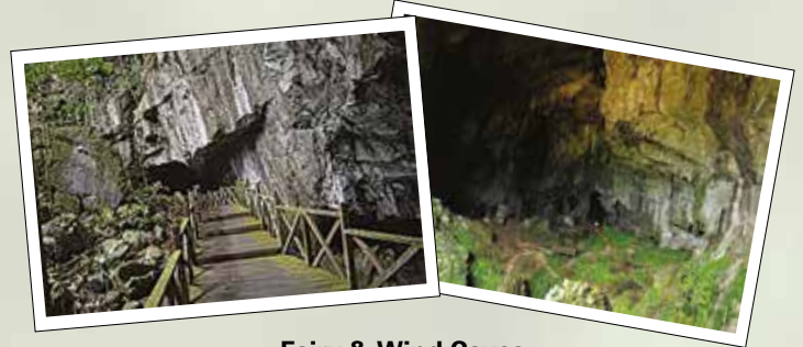
Fairy & Wind Caves (Duration: 4 – 5 hours)