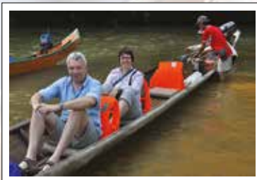
Longhouse Experience – Lemanak (Duration: 2D/1N)