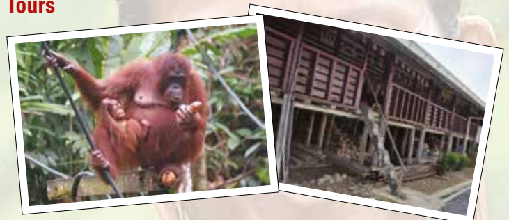
Semenggoh Orang Utan & Mongkos Bidayuh Longhouse (Duration: 2D/1N)