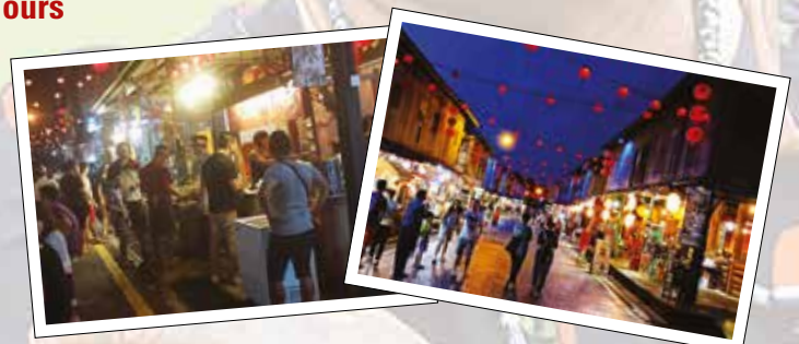
Siniawan Food Market (Duration: 3 – 4 hours)