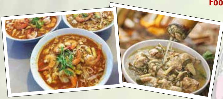
Heritage Walking & Food Tour (Duration: 4 hours)