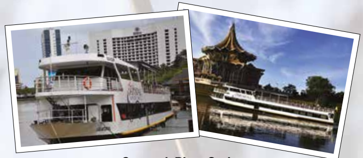
Sarawak River Cruise (Duration: 1.5 hours)