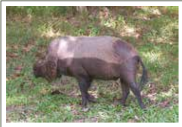
Bako Wildlife Encounter (Duration: Day trip)