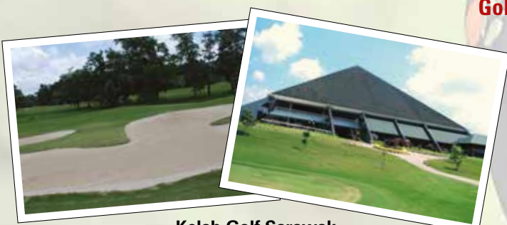
Kelab Golf Sarawak