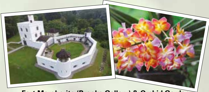
Fort Margherita (Brooke Gallery) & Orchid Garden (Duration: 3.5 hours)