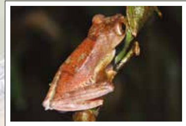
Frog Tour at Kubah National Park (Duration: 4 – 5 hours)