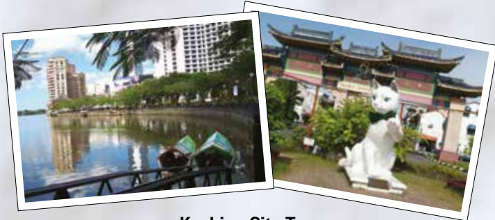
Kuching City Tour (Duration: 3 hours)