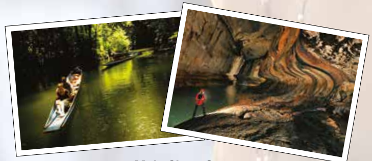
Mulu Show Caves (Duration: 3D/2N)

For further information and booking, please contact the tour agent