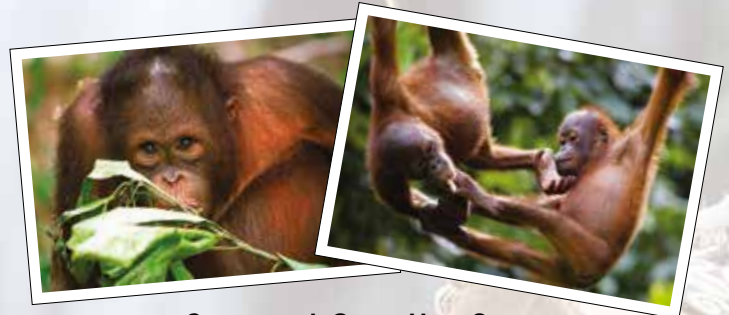
Semenggoh Orang Utan Centre (Duration: 3 hours)