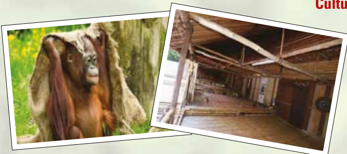
Semenggoh Orang Utan & Land Dayak Longhouse (Duration: 4 – 5 hours)